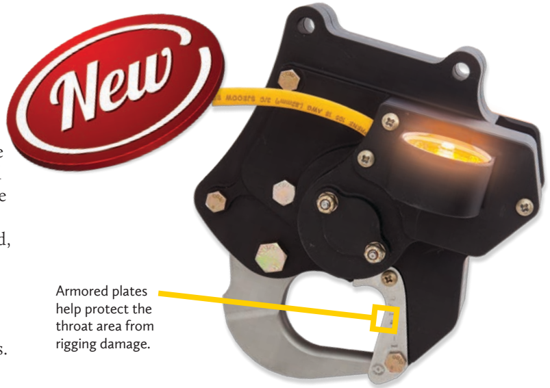
TALON 1K Carousel Hook with Light (P/N 528-044-10)