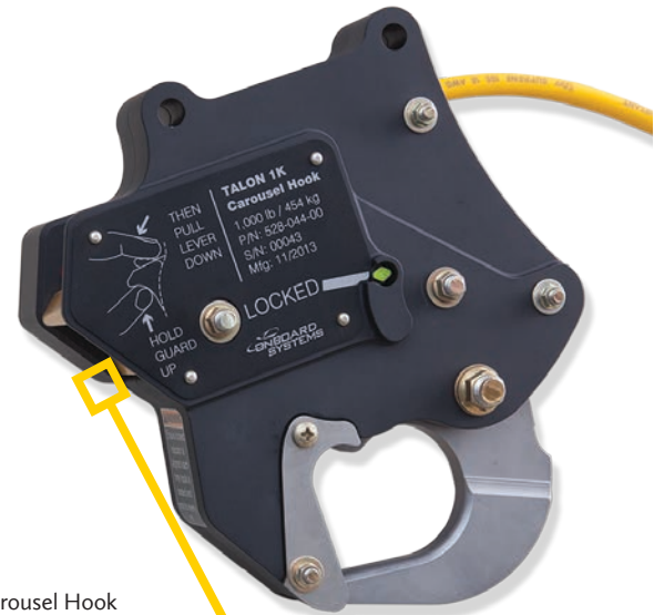
TALON 1K Carousel Hook (P/N 528-044-00)